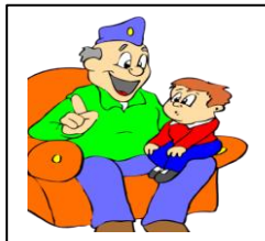
second - grandfather