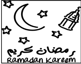
Muslims - Ramadan

A) Form three meaningful sentences using the guide words provided