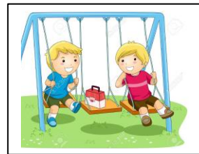
third - go