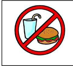
eat - drink